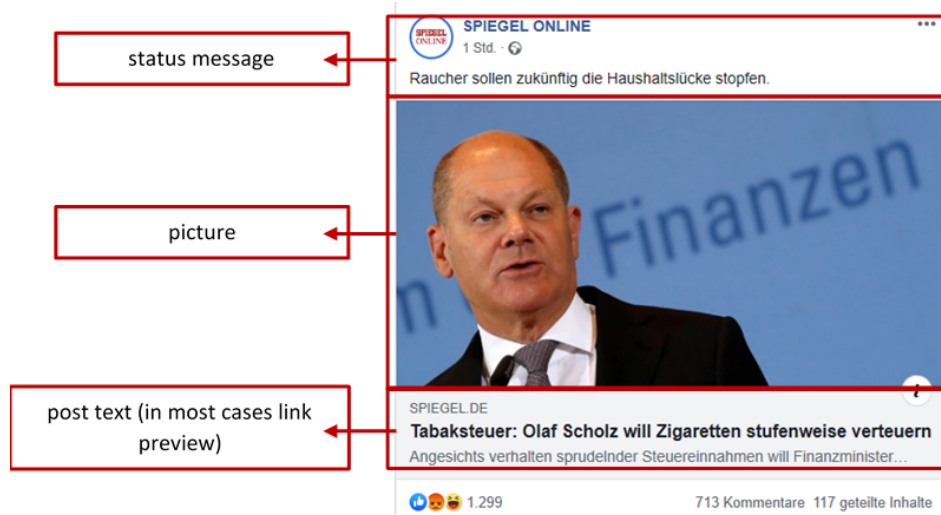
Figure 2. Structure of Facebook posts: Units of analysis. Note: See Welbers and Opgenhaffen (2019, p. 50).

analysis of Belgian and Dutch newspapers, but they restricted their study to a single soft news aspect, the use of subjective language.