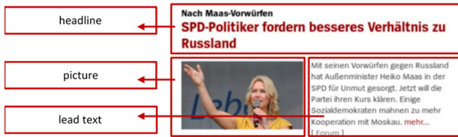
Figure 3. Structure of website teaser: Units of analysis.

a sub-index. The sub-indices from all sub-dimensions were then again averaged into an overall index. Again, the values of this index range from 0 (no features at all; not softened at all) to 1 (all features used to the greatest possible extent; completely softened).