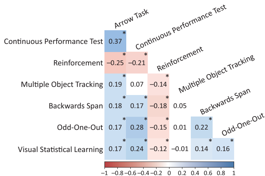
Figure 1. Values from general linear model between League of Legends MMR and cognitive abilities.