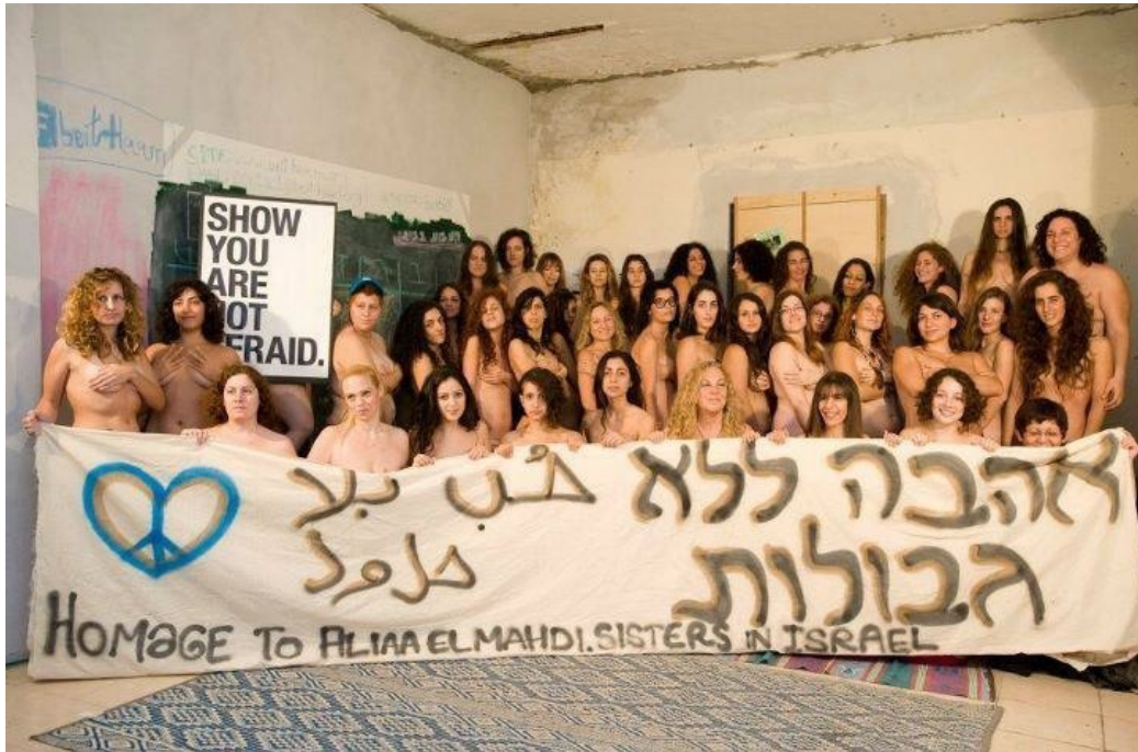
Figure 3. Israeli women posing nude “Love without Limits” and “Homage to Aliaa Elmahdy Sisters in Israel” (2011).

her and divert her message. In effect, they used the same participatory tool and approach the supporters used to endorse Elmahdy in order to mock and reject her.