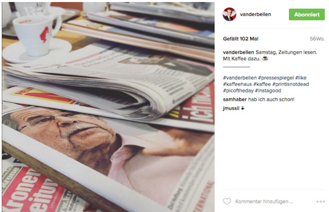
Figure 5. Coffee and Newspapers, posted on 9 January 2016.

or welcome ceremony, or shaking hands), discussion (n = 18; Van der Bellen was frequently presented in debates with young voters) and endorsement (n = 17; which showed mostly prominent supporters, e.g. in March, April and May 2016) underscore the political importance of the candidate.