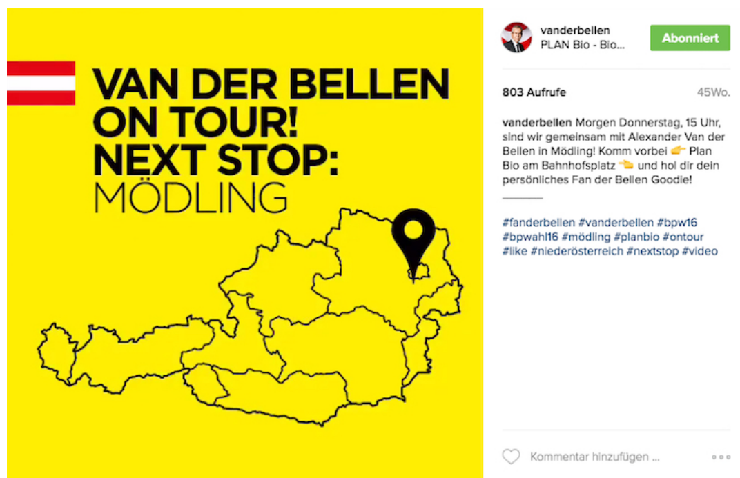
Figure 1. Van der Bellen on tour, posted on 6 April 2016.

The image type media work (n = 79) comprises visual imagery that shows the candidate during interviews or press conferences, or at events organized by media representatives (e.g., panel discussions). Among these